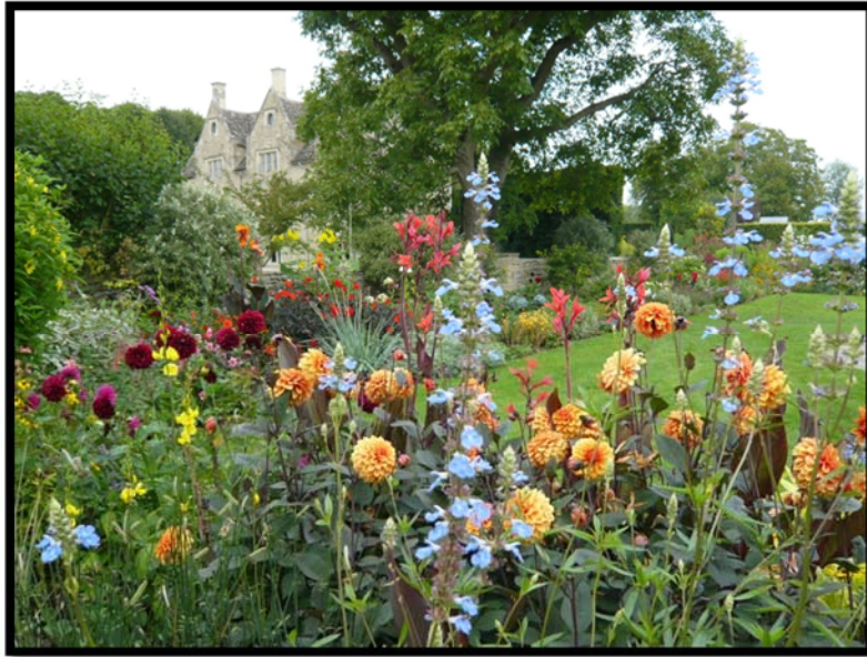
Radcot House garden

After lunch we go to the nearby garden of Radcot House . This 3 acre garden, which opens for The National Garden Scheme, has also been recently renovated, with an eye to detail, by the new owners. It has a walled garden, a poolroom, a waterway, a reading room, a beech avenue, a long pond and a pavilion area. Self service tea and coffee is available.