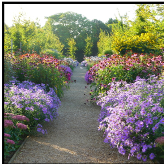
Ashton Pottery Hornbeam Walk in September